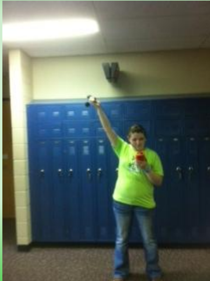
Learning how to use a light meter

Students used a variety of equipment to complete the investigations.